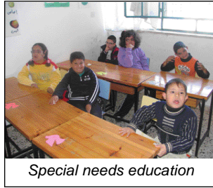
Special needs education