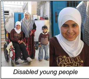
Disabled young people

The Hope Christian Trust has been supporting communities and encouraging Christian ministry in Israel and Palestine for over 25 years. It supports students and training at Bethlehem Bible College and gives teacher training and provides educational equipment for the Christian Lighthouse School in Gaza. It funds teachers and projects to show love and care for children with disabilities and who have special needs in a Christian school in Hebron and the House of Hope in Bethlehem. The Trust also seeks to respond to appeals for emergency help in the area through the Shepherd's Society, the caring arm of Bethlehem Bible College.