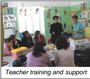
Teacher training and support