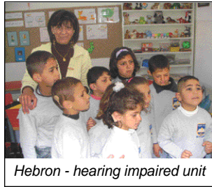
Hebron - hearing impaired unit

My response to the needs for children, young people and communities to find 'a hope for a future' (Jeremiah 29.11-13)